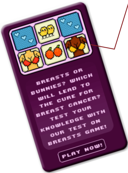
Using social media posts like this one on Instagram, PETA encourages adolescents to rebel against their parents and teachers.