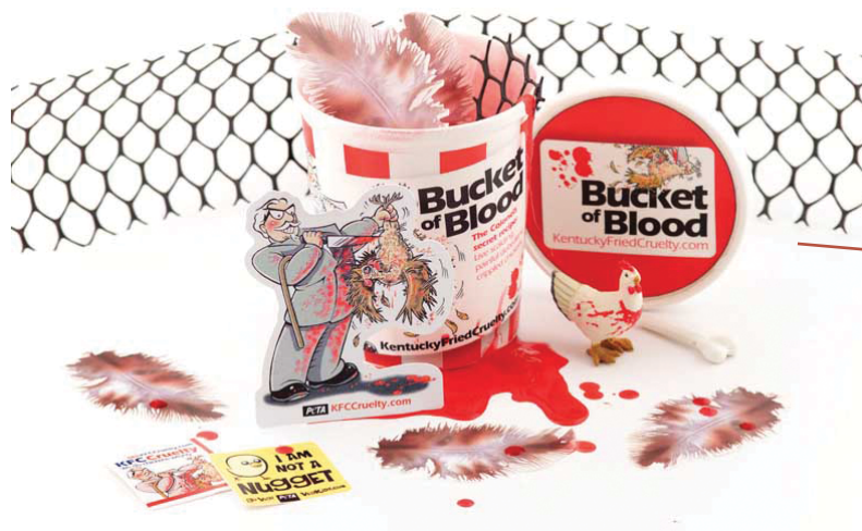
In 2004, PETA gave these "Buckets of Blood" to children exiting fast-food chicken restaurants in at least 10 U.S. states.