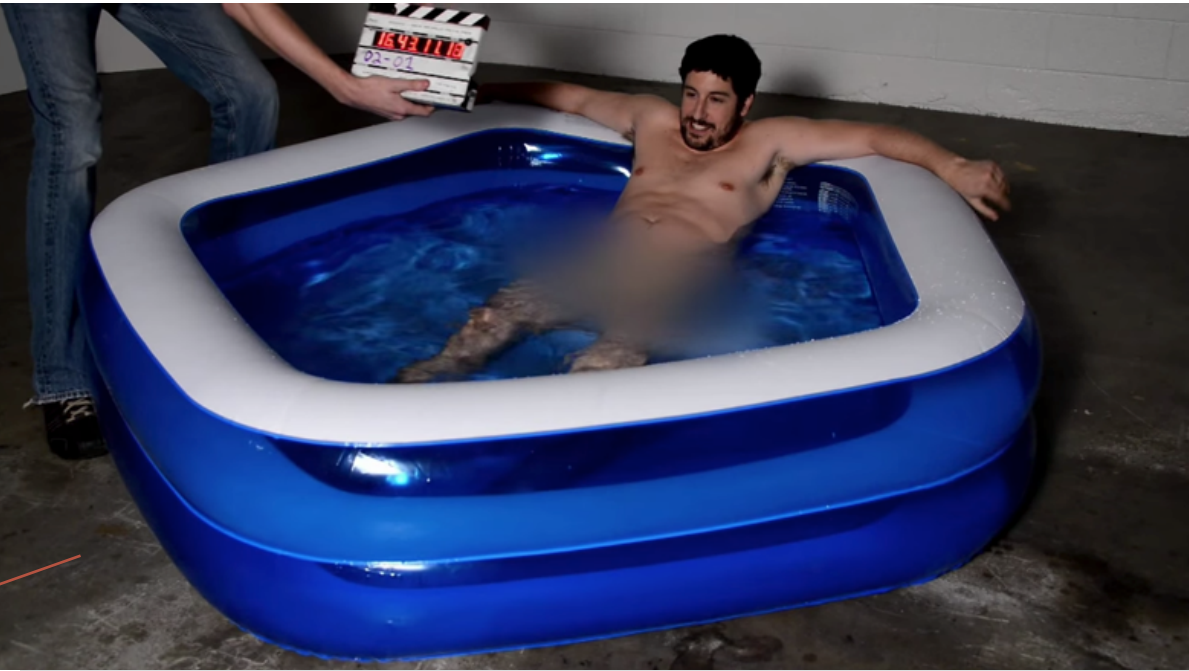
A combination of celebrity and sexual content drives many PETA messages.

— Chicago Sun-Times letter to the editor from a concerned parent