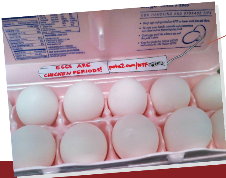
peta2 ran a contest instructing kids to print an image of a tampon and tape it “on the cartons of eggs in your fridge at home” because “If you wouldn’t squeeze out your girlfriend’s tampon to make an omelet, it doesn’t make sense to cook a chicken’s period for breakfast.”

As kids grow up and basic animal-rights propaganda sinks in, PETA gives young adolescents a road map for getting “active” in the “movement.” It’s called the “peta2 Street Team,” and it’s one part scavenger hunt, one part Marlboro Catalog. PETA brags that more than 100,000 children have already signed up for its “Youth Action Team.”