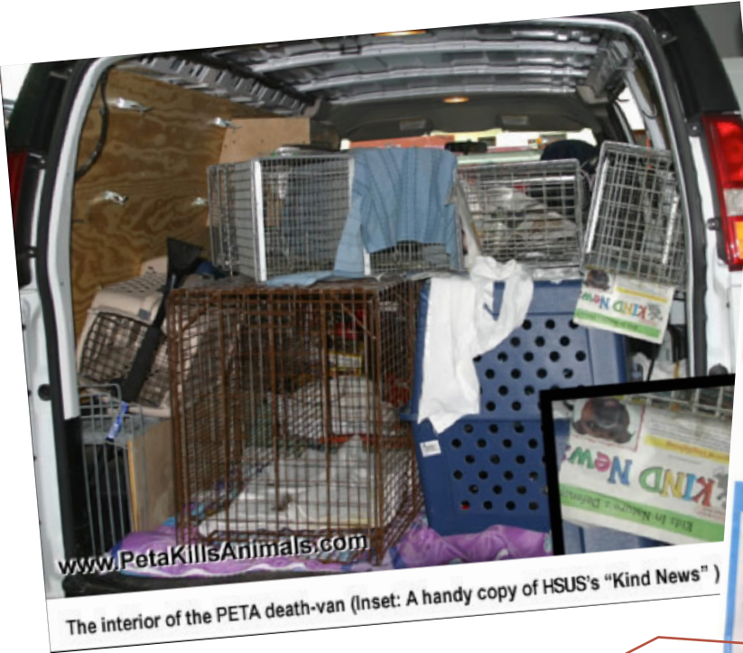
The interior of the PETA death-van (Inset: A handy copy of HSUS's "Kind News")

Says HSUS CEO Wayne Pacelle: “I think getting to young people ... is so important. Getting our message out to young people can really send them in our direction and cause them to really act on our beliefs.”