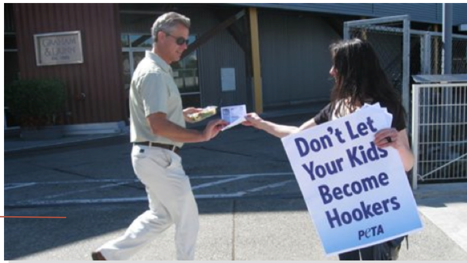
PETA's anti-fishing effort was called a "kid-focused smear campaign" by a local commentator.

PETA pulled a similar stunt in 2014 but this time with a 6-year old boy. The Salt Lake City Weekly reported the group planned to chain up the child dressed in an elephant costume. The report noted PETA has "a history of using children as protesting props." A local PETA employee did not dispute this characterization, telling the paper that "Numerous children have joined PETA demonstrations over the last several years."